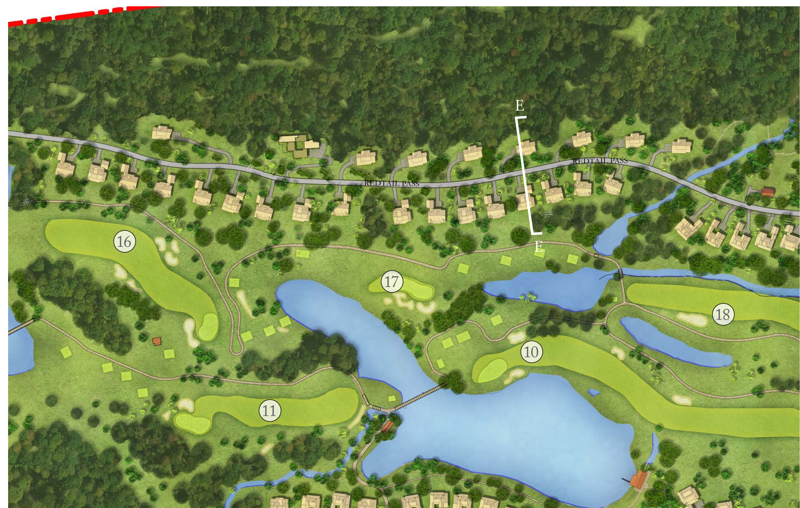
KEY PLAN (NOT TO SCALE)